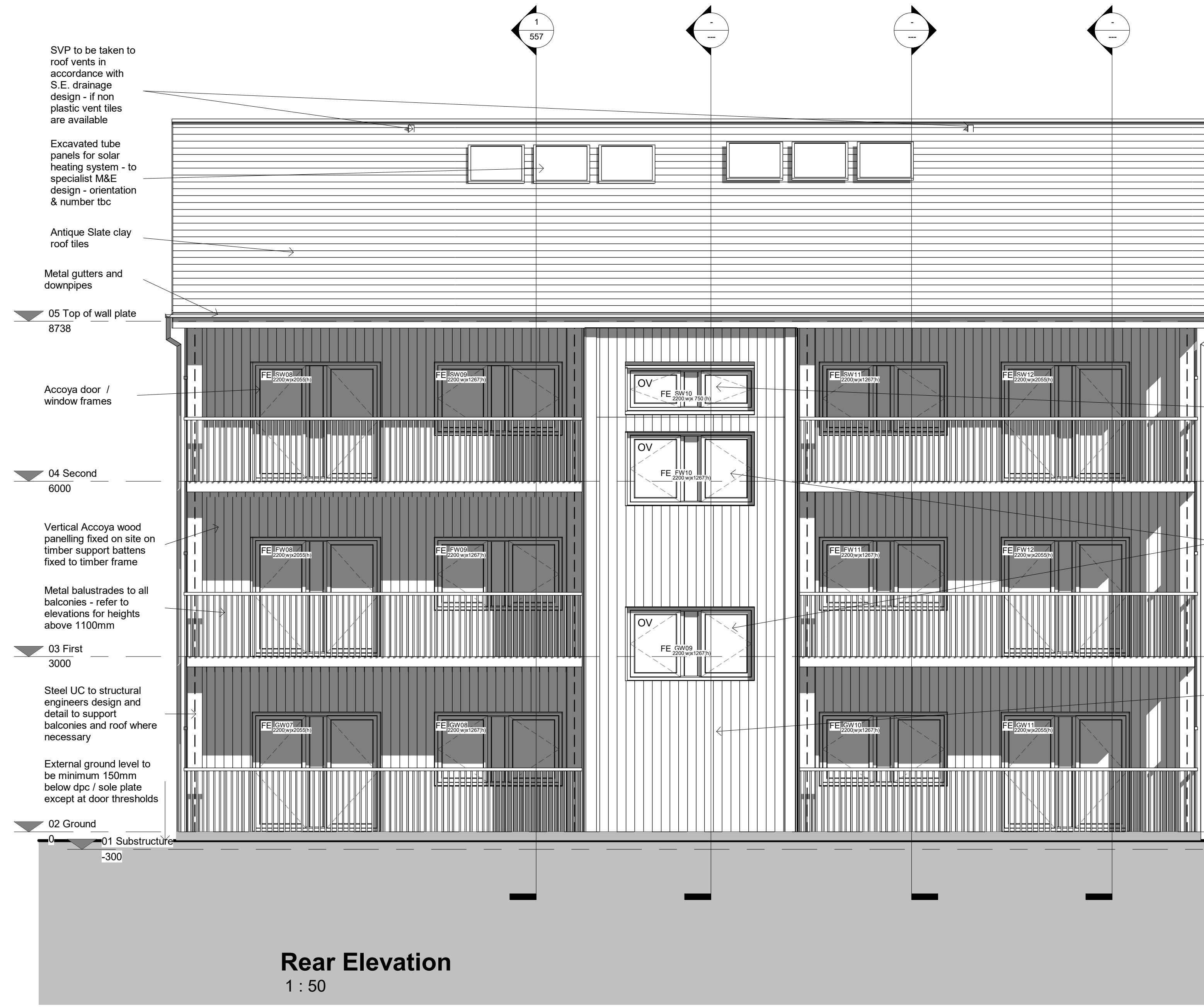
Rear Elevation 1 : 50