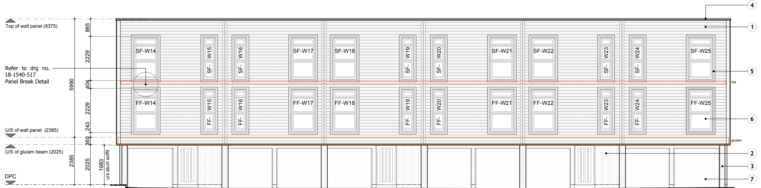
REAR ELEVATION (CAR PARK)