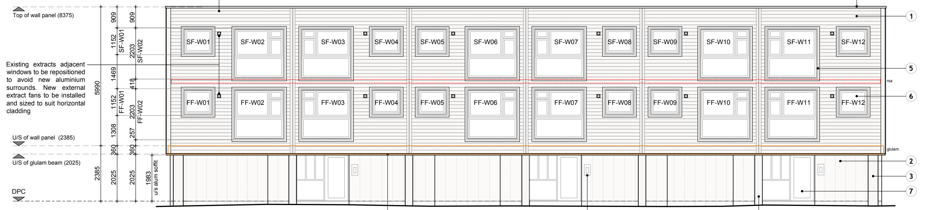
FRONT ELEVATION (DARLASTON ROAD)

New flat roof to accommodate Photo Voltaic Panels (quantity in accordance with SAP Assessor's reco.) PV to be fed into dwellings own electric meter.